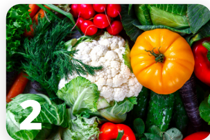
2 The world's food basket of choice