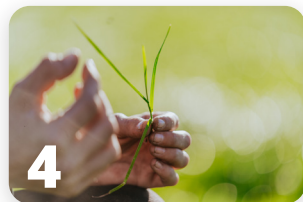
4 Green shoots

We will be running five workshops across the region in March 2024 to share, test and refine these scenarios with farmers and growers throughout the region.