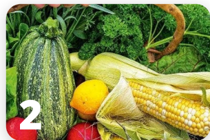
2 The world's food basket of choice